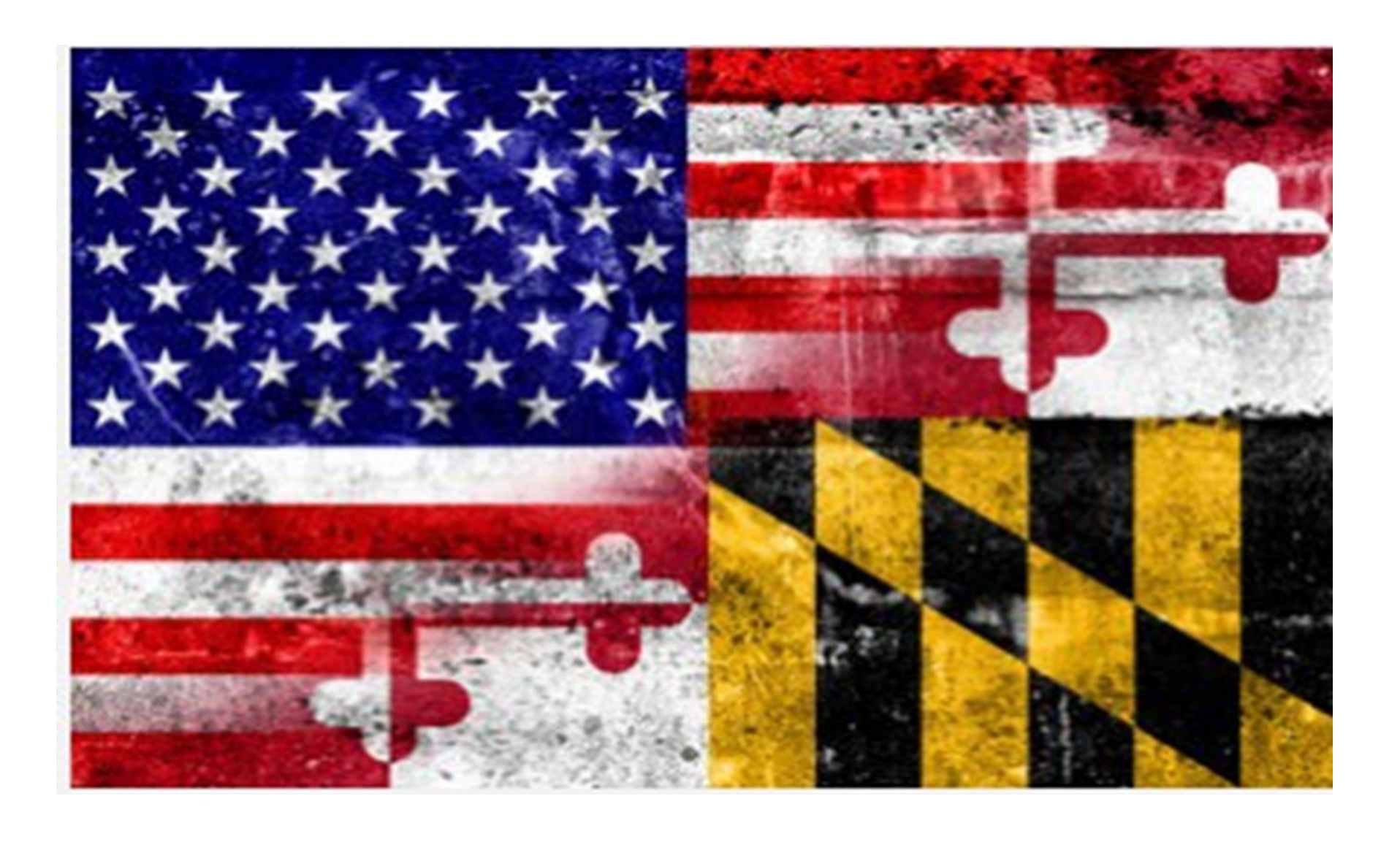
Statewide Distance Learning Definitions