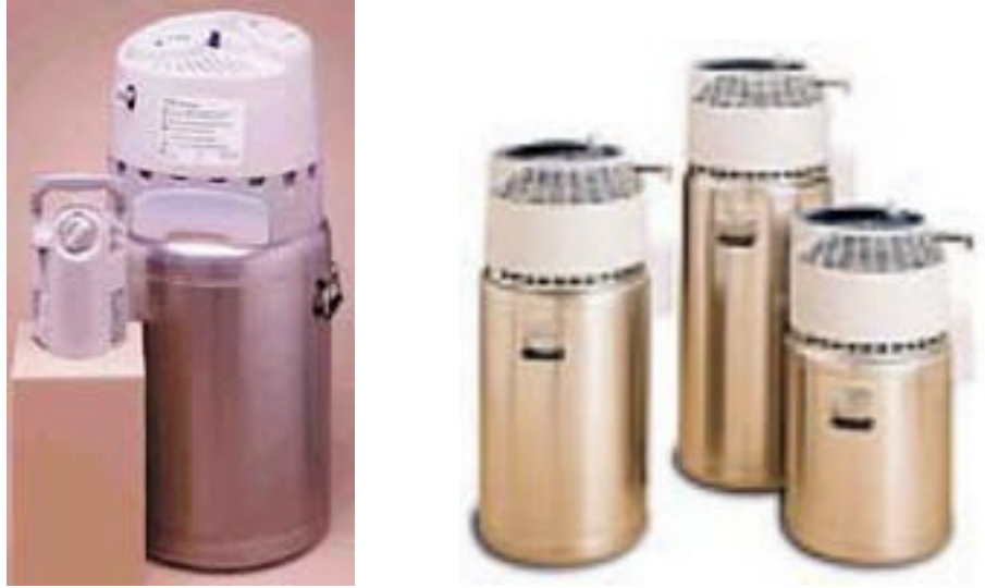
Figure 5. LOX base stations.

Base station containers hold up to 12 gal (50 L) of LOX and are similar to, but larger than, the portables. (See Figure 5.) The portables plug into or onto the base station and are automatically filled. The system's supplier usually refills the base station. During filling, moisture from the air will condense and freeze on the piping and connectors. Occasionally, this freezing will glue the portable to the base station. Allowing the system to thaw will free the portable. Most base stations can also provide oxygen to the user independent of the portable unit.