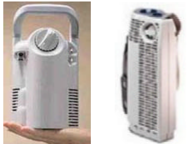
Figure 4. Portable LOX units.

Portable containers hold up to a half-gallon (2 L) of LOX or 29 to 58 cu. ft. (800 to 1600 L) of GOX. (See Figure 4.) Portable containers are carried with shoulder straps, in backpacks, or in handbags, allowing the user to be mobile. The carrying packs are vented. Most portable containers have a connector to allow the portable to be filled from a base station. This connector must be kept free of dirt and lint. A portable container from one supplier usually cannot be used with a base station from another supplier.