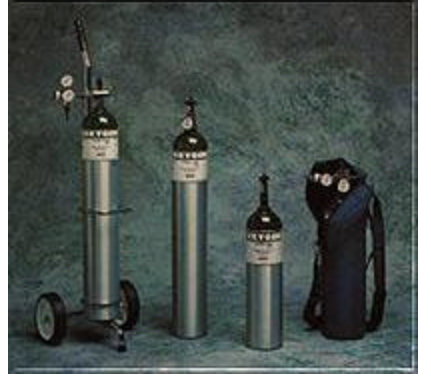
Figure 2. Sample portable systems.