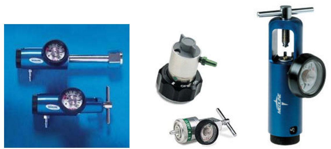
Figure 3 a, b & c. regulators. Note reusable gasket inside yoke in right-most figure.

A regulator must be attached to a cylinder to convert the high-pressure gas to a gas at atmospheric (or room) pressure with a controlled flow. (See Figure 3 a, b, & c.) Most regulators for portable systems attach to the cylinder's supply valve with a screw clamp that can be hand tightened, and require a gasket to seal the regulator to the supply valve's outlet port. Regulators for stationary systems attach to the cylinder valve with a connector that must be wrench tightened, and do not require a gasket.