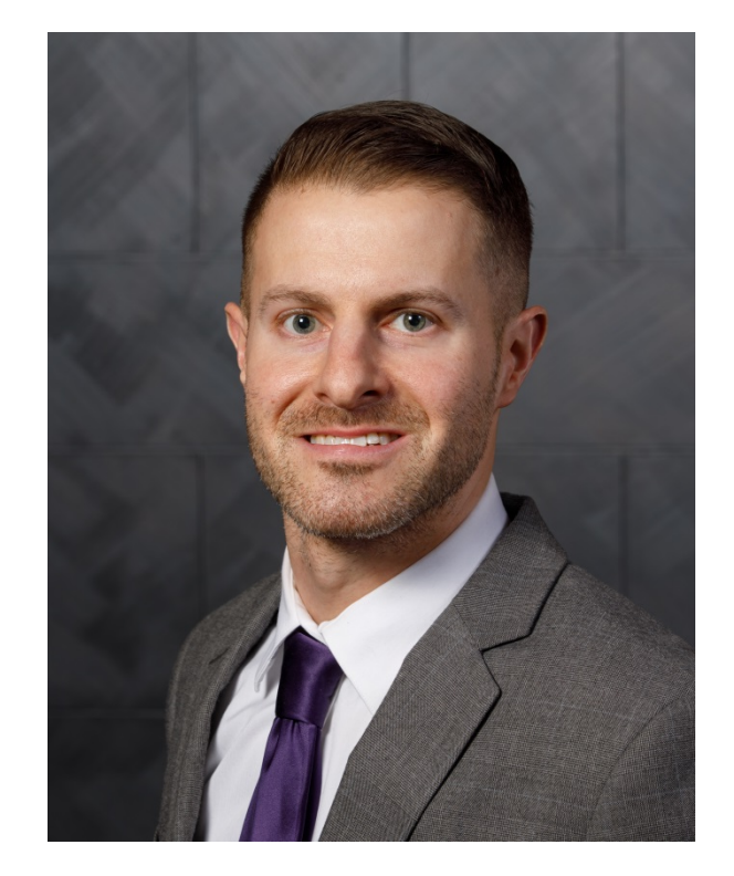
Art Grades 6 – 8