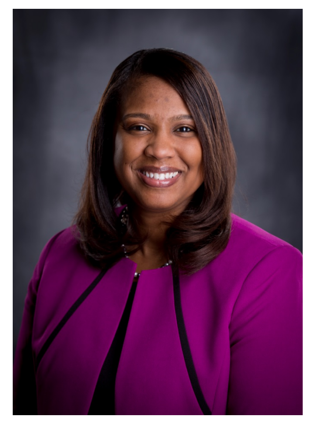
Special Education Grades 3 – 6