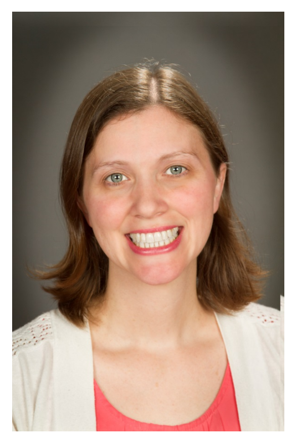
Theater/English Grades 9 – 12