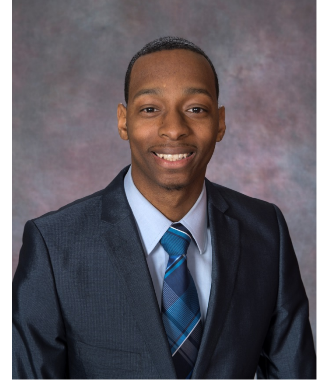
Science & S.T.E.M Grade 8