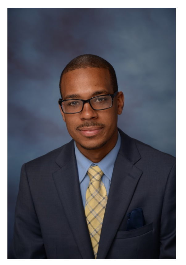
Math & Science Grade 3