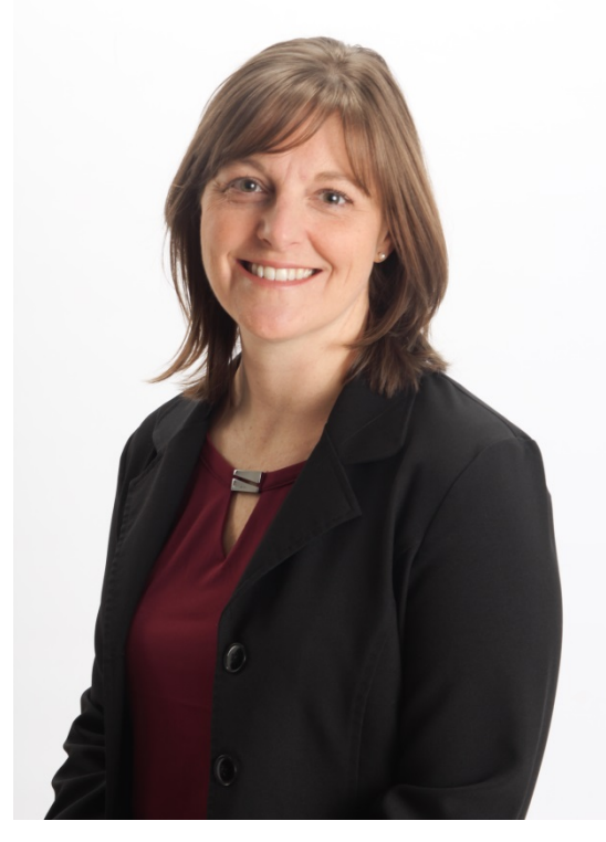
Mathematics Grades 10 – 12