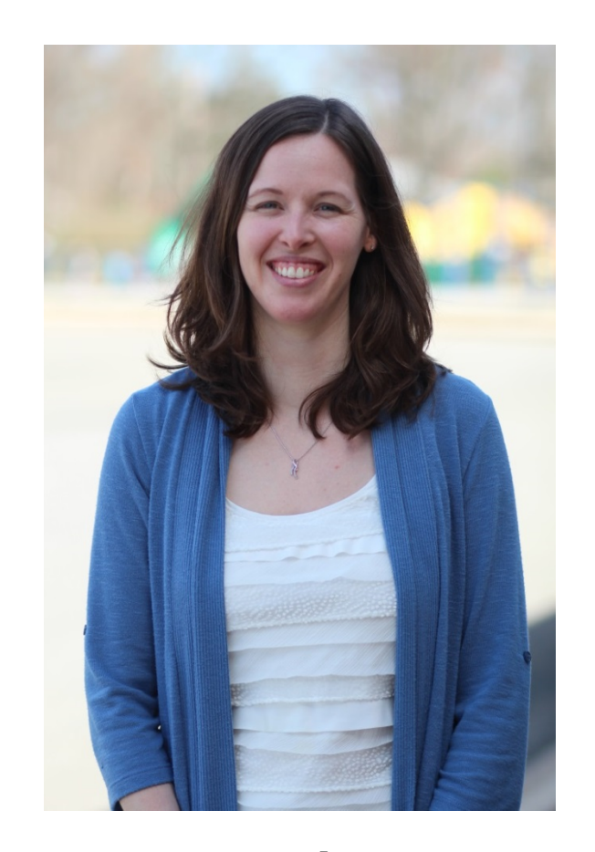
Instructional Resources Teacher