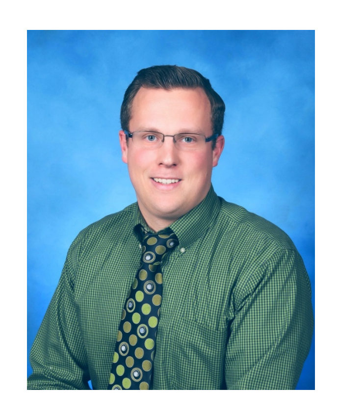
Math & Science Grade 4