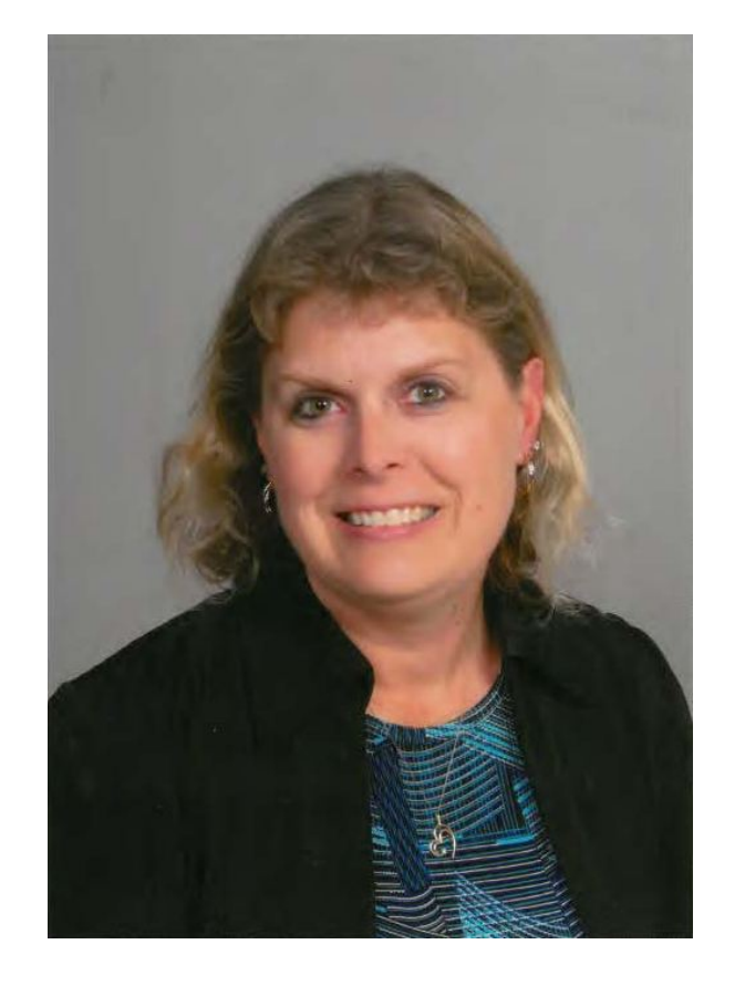
\begin{array}{c} ESOL \\ Grade \ s \ K-5 \end{array}