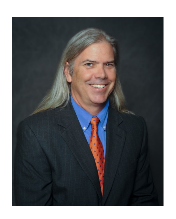
English Grades 9 – 12