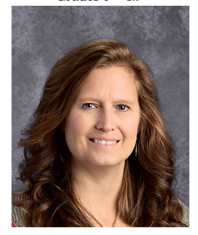
English Grades 9 – 12