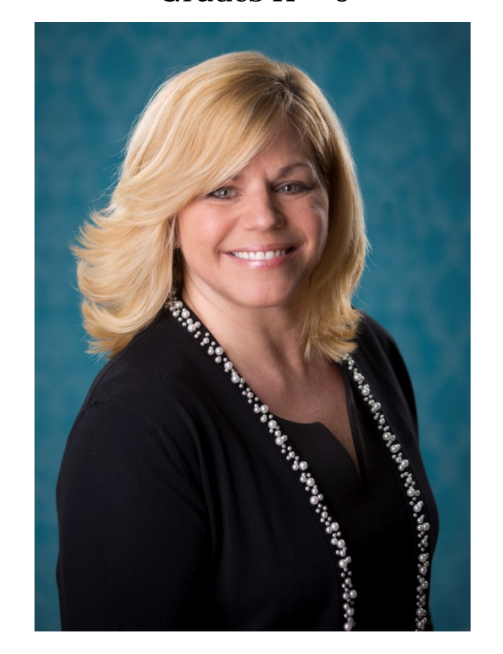
Reading Grades K – 5