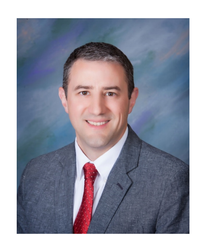
Social Studies Grades 9 - 12