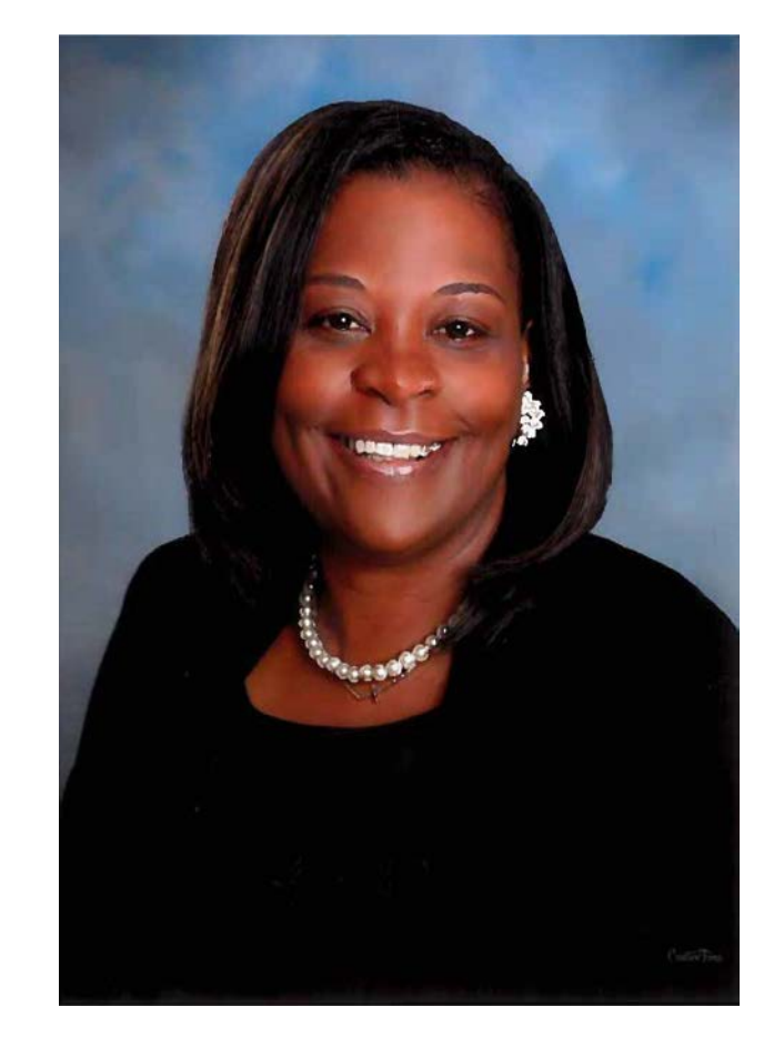
Language Arts Grade 5