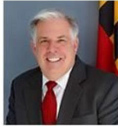
Larry Hogan Governor