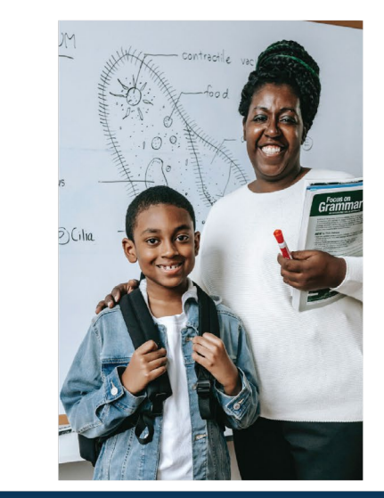
HIGH-QUALITY & DIVERSE TEACHERS & LEADERS